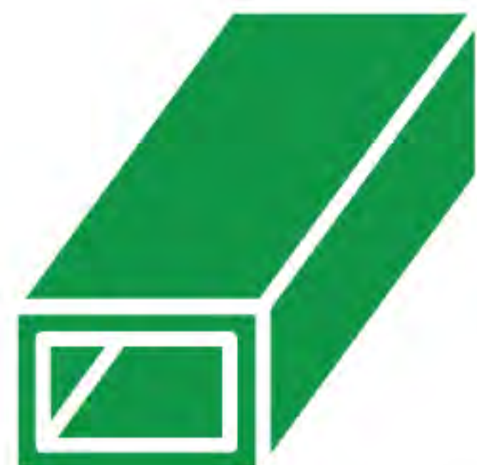
FULLY WELDED ALUMINUM STRUCTURE