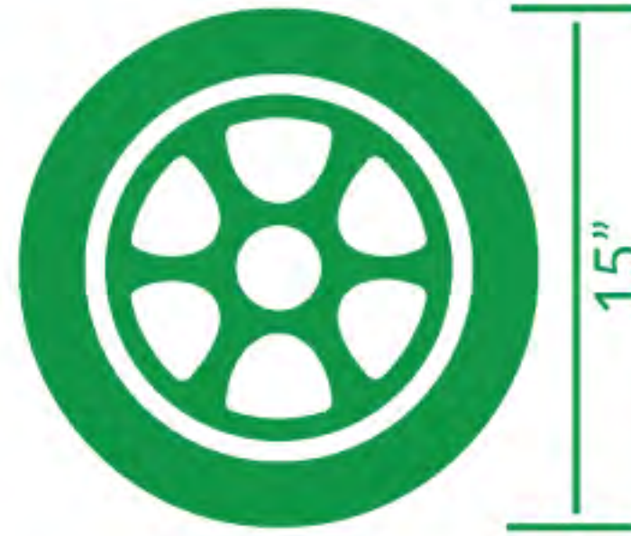
LIFT IT UP! +4" HIGHER