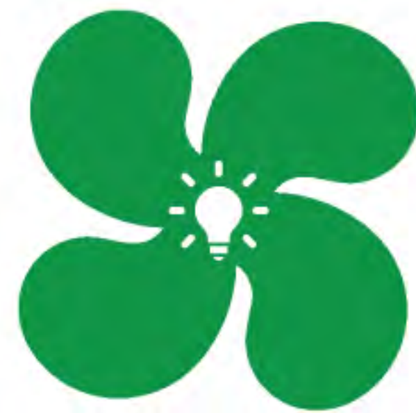
FAN AND LIGHT PACKAGE