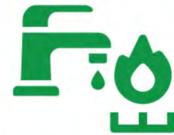
CONVENIENCE PACKAGE (80 ONLY)