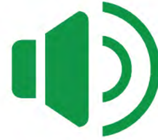
STEREO AND MARINE SPEAKERS