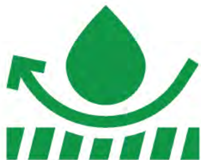
WATERPROOF MARINE VINYL