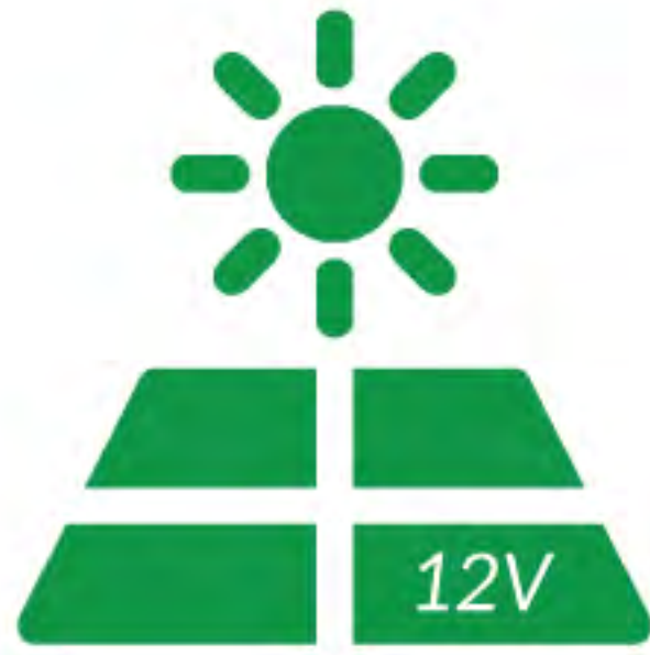
20 WATT SOLAR PANEL KIT